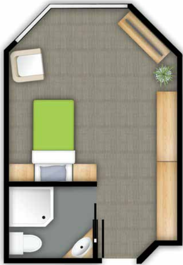
Private, suite Type A & B