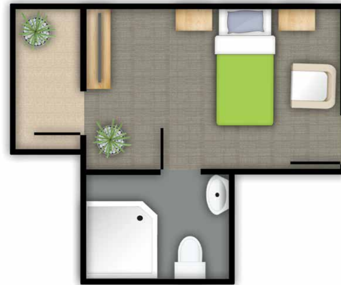
Private, suite Typical