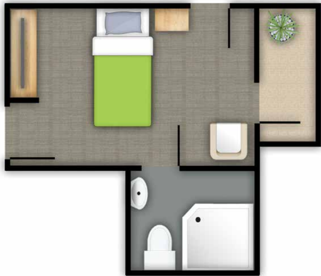
Private, suite Accessible