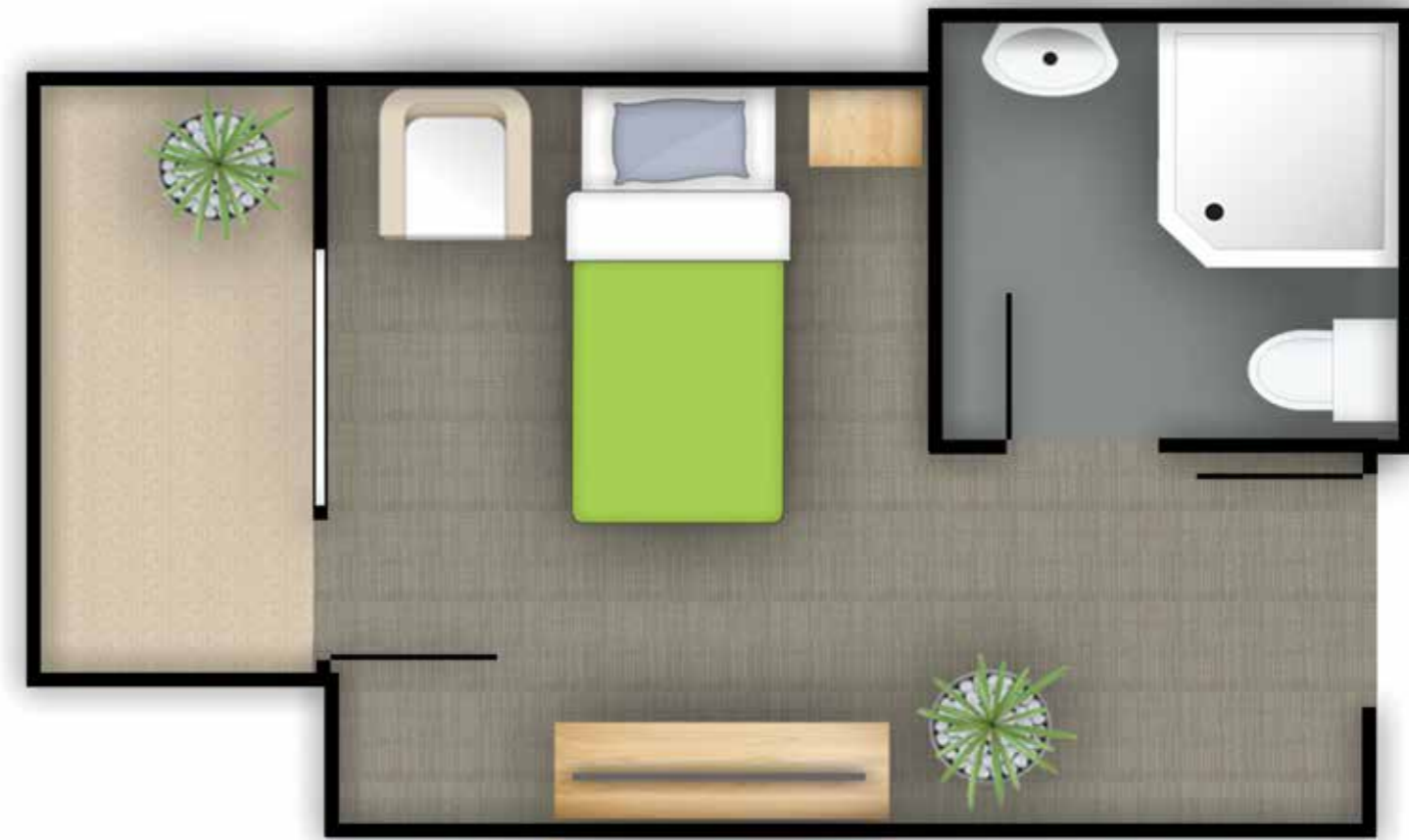
Private, suite Typical