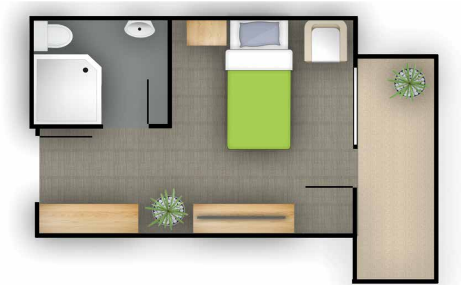
Private, suite Accessible