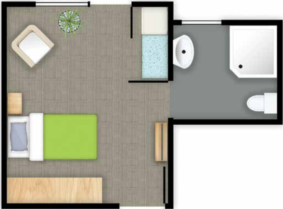
Private, suites Typical