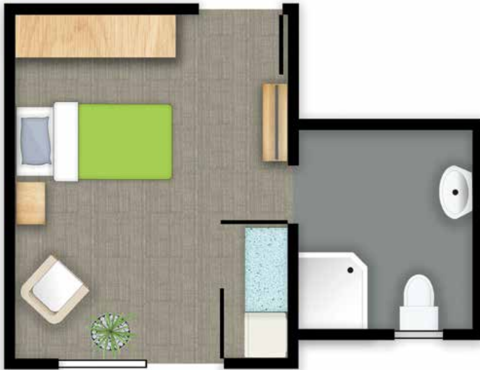
Private, suite Accessible