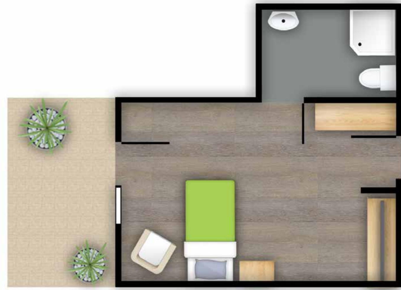
Private, suite Typical