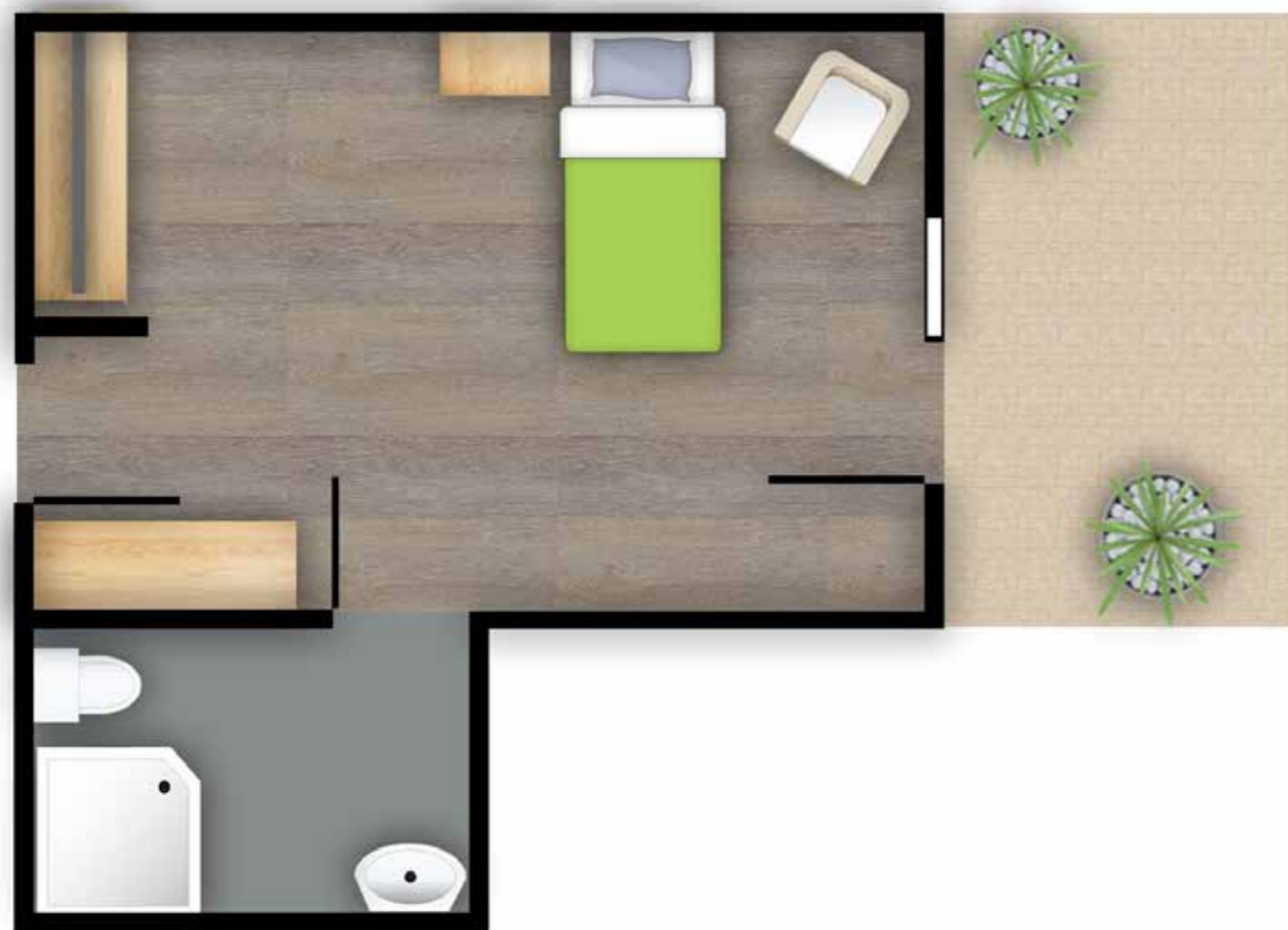
Private, suite Accessible