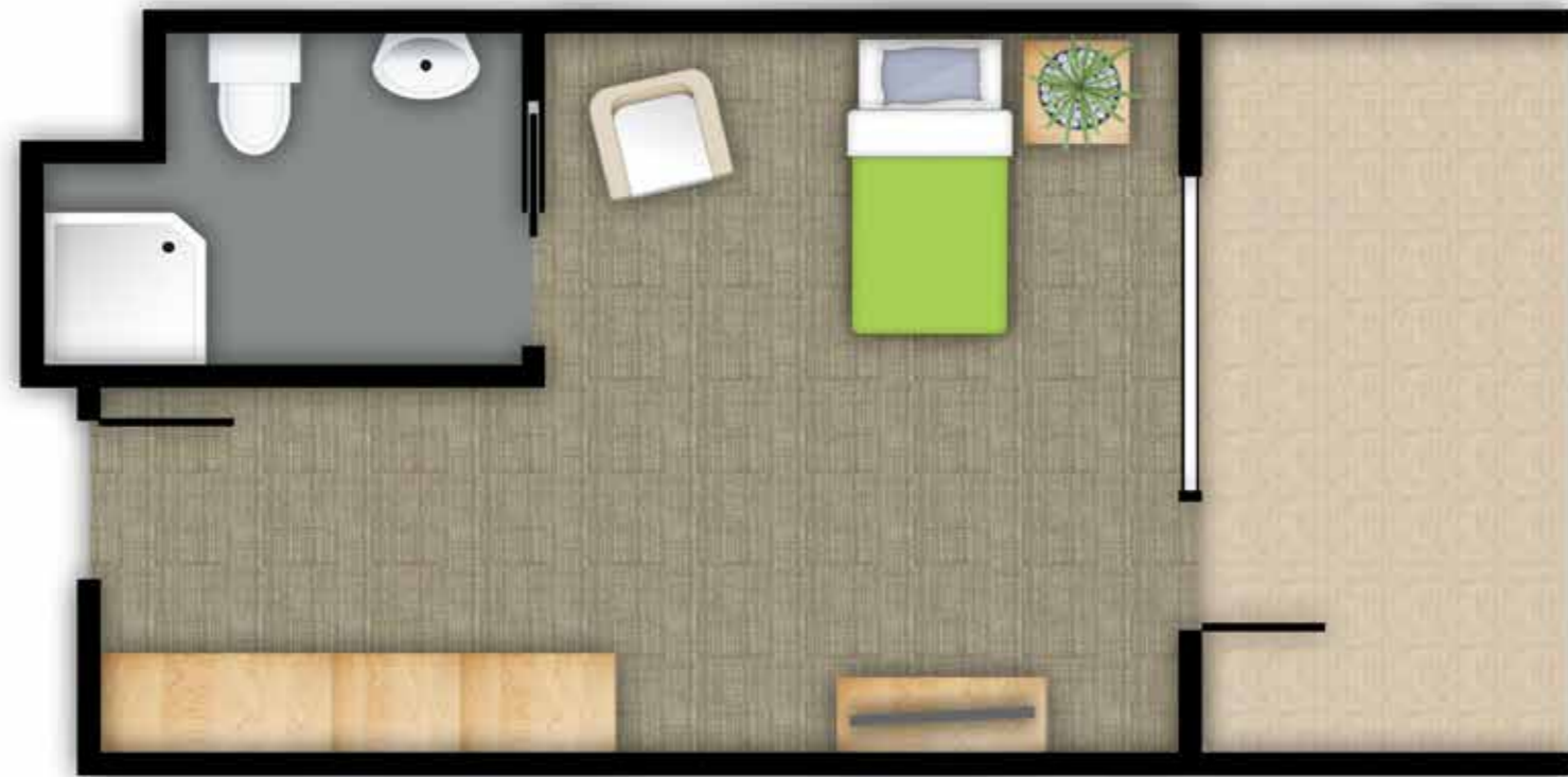
Private, suite Accessible