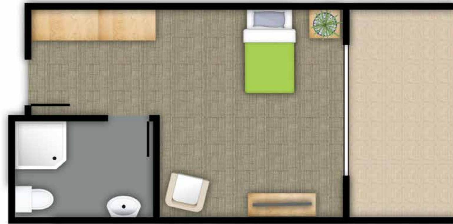
Private, suite Typical