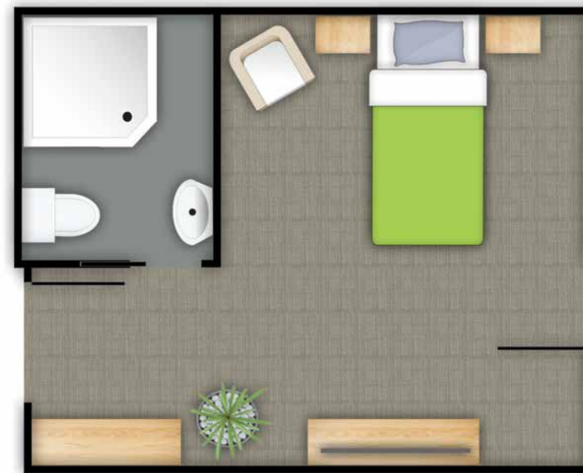
Private, suite Typical