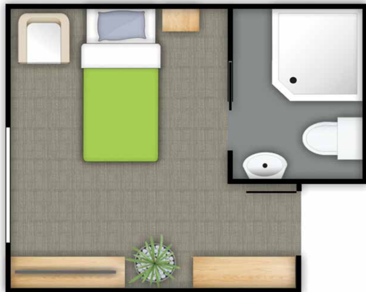
Private, suite Accessible