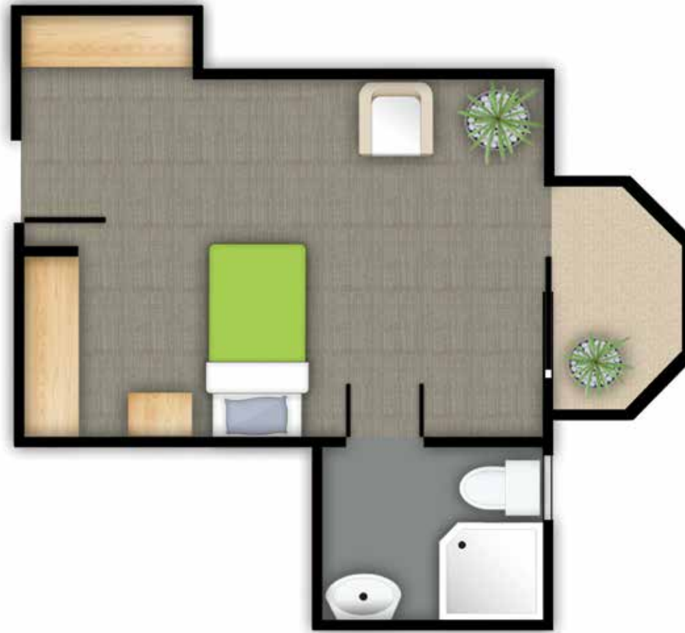
Private, suite Typical