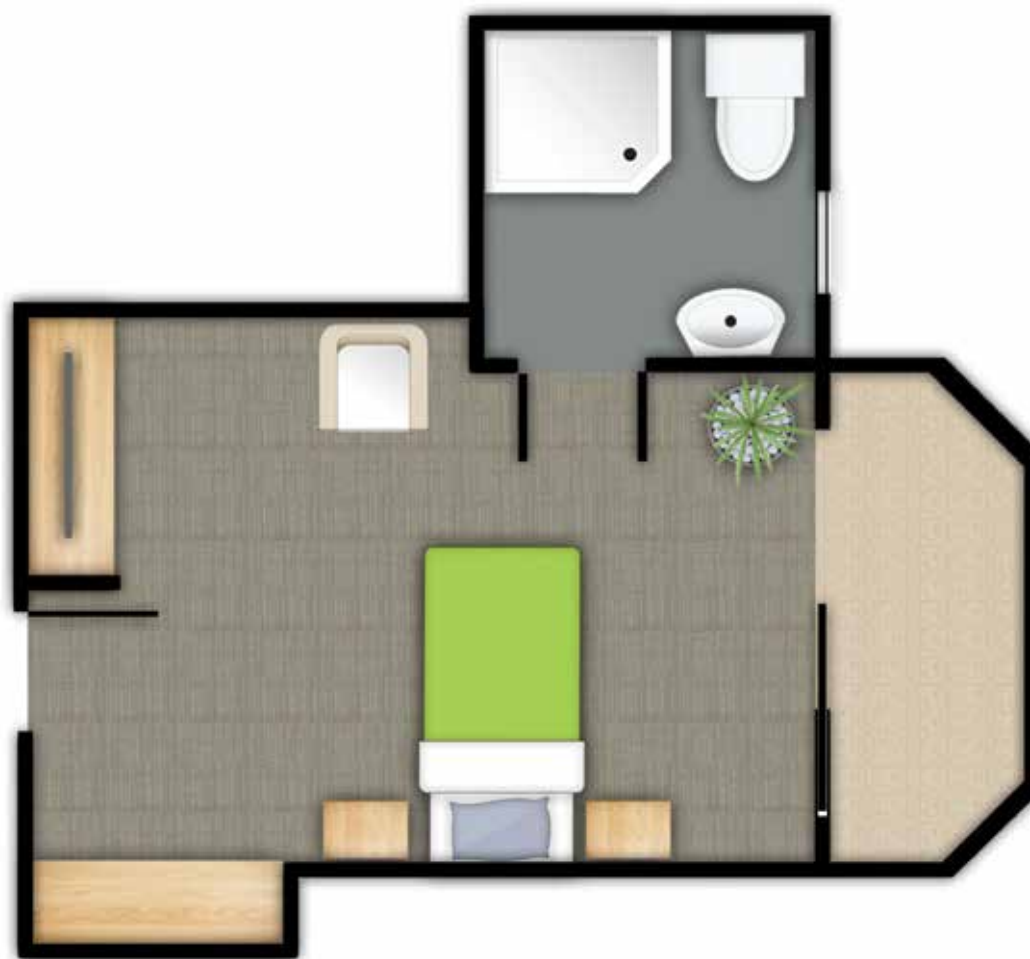
Private, suite Accessible