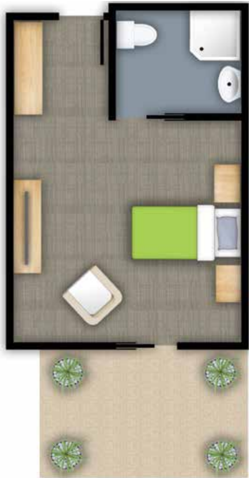
Private suite Typical, Type A