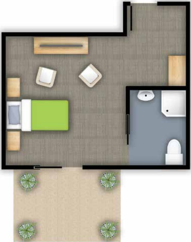
Private suite Typical, Type B