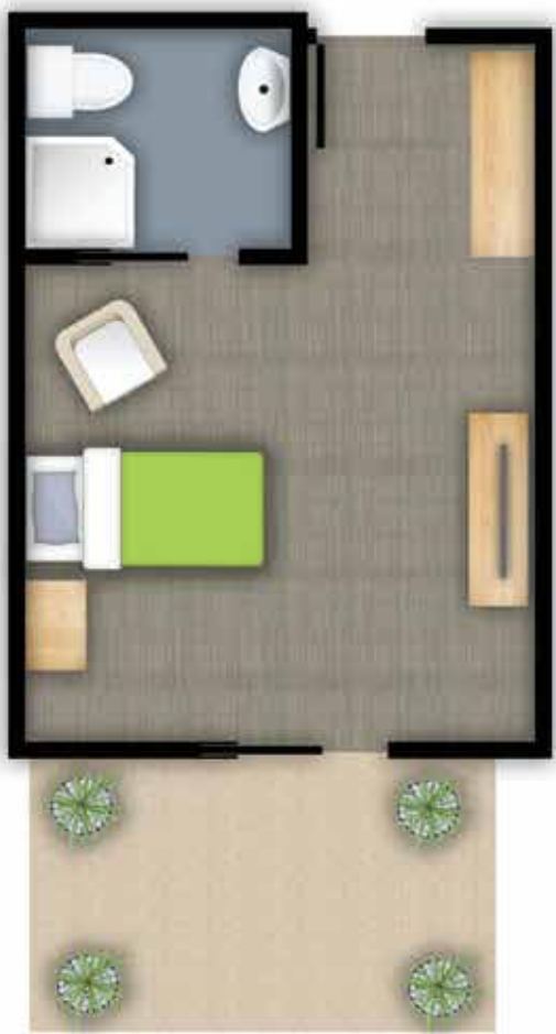
Private suite Accessible