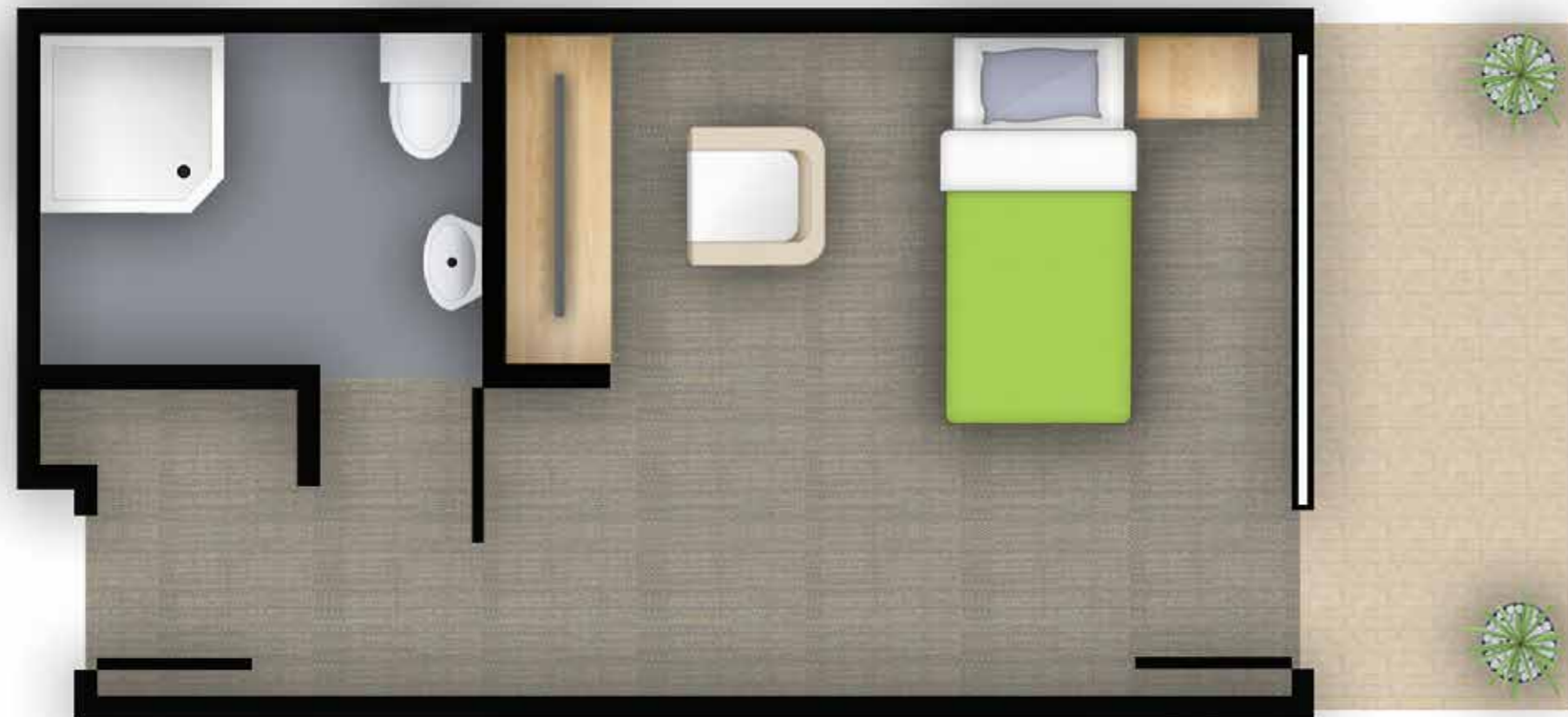
Private, suite Typical A