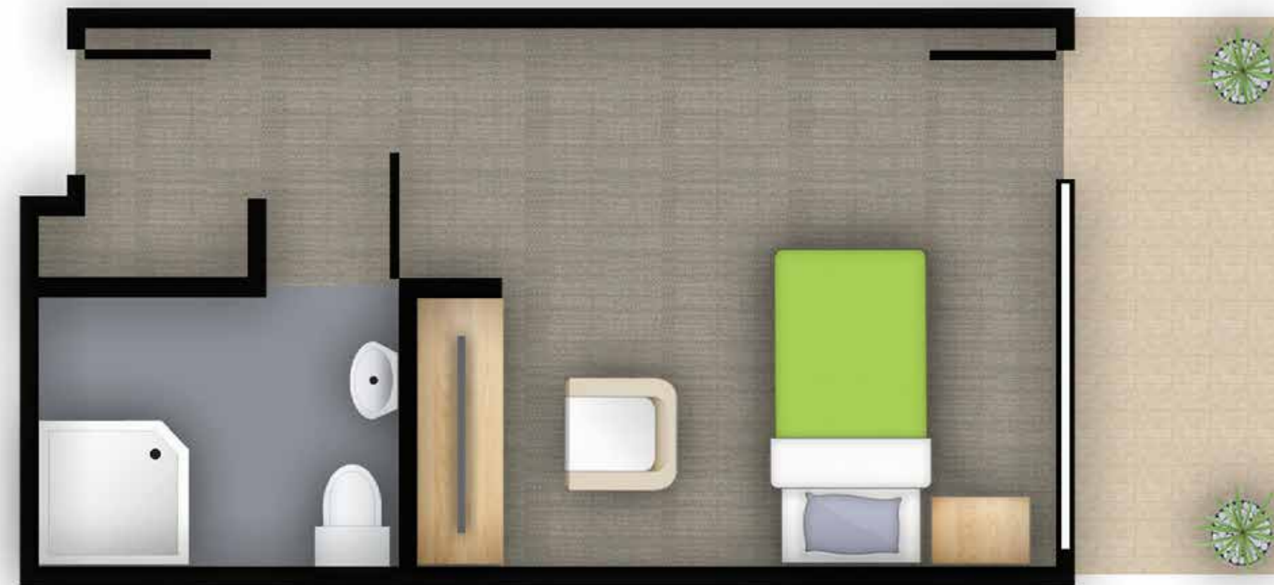
Private, suite Typical B