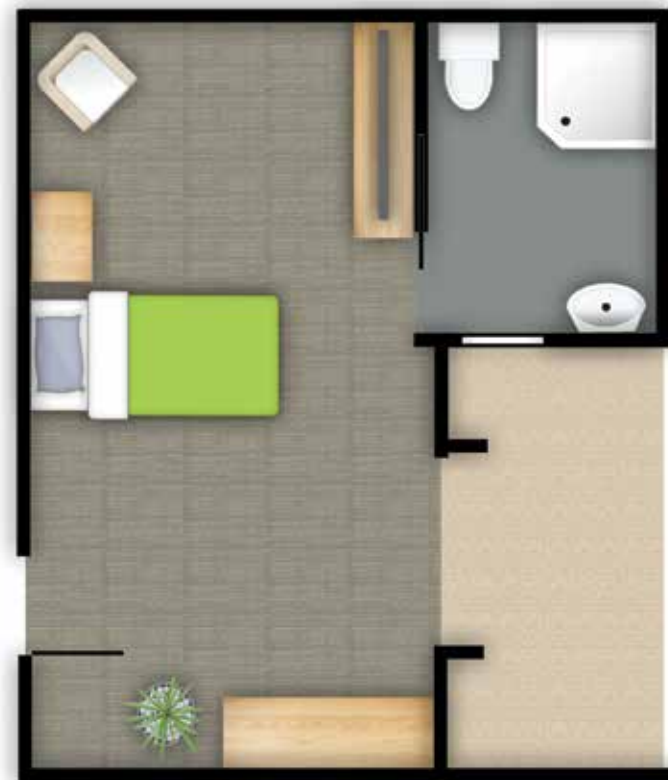
Private, suite Accessible