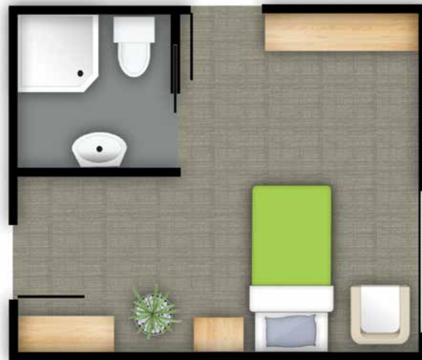
Private, suite Typical