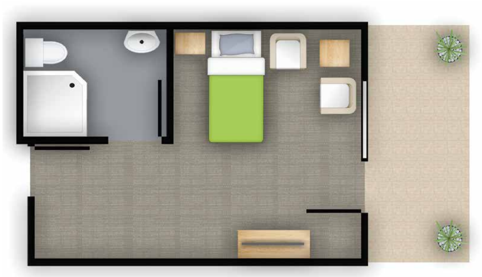
Private, suite Typical