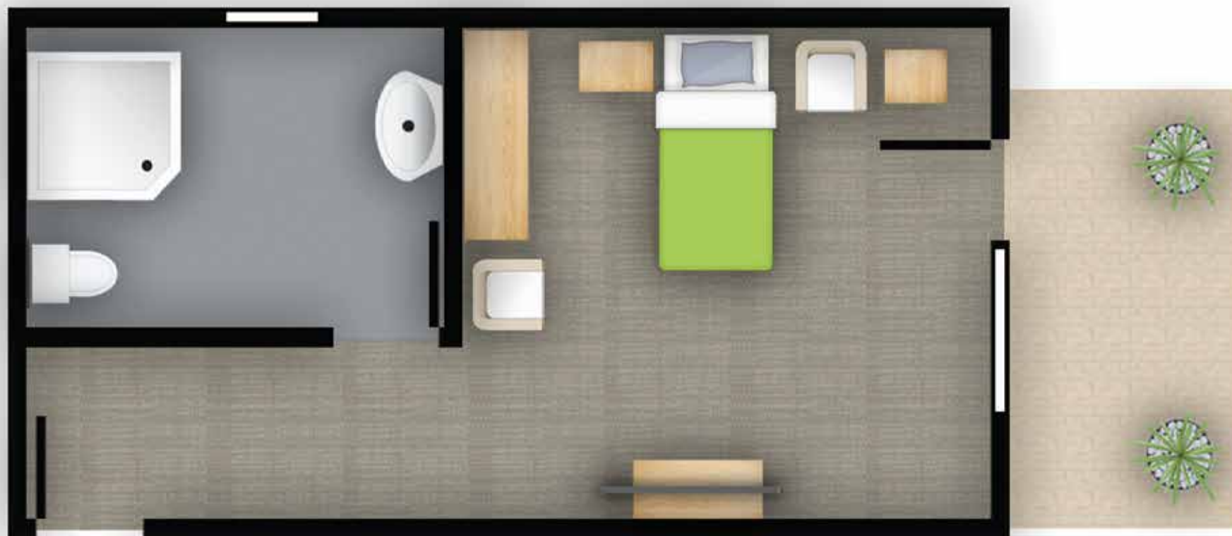
Private, suite Accessible