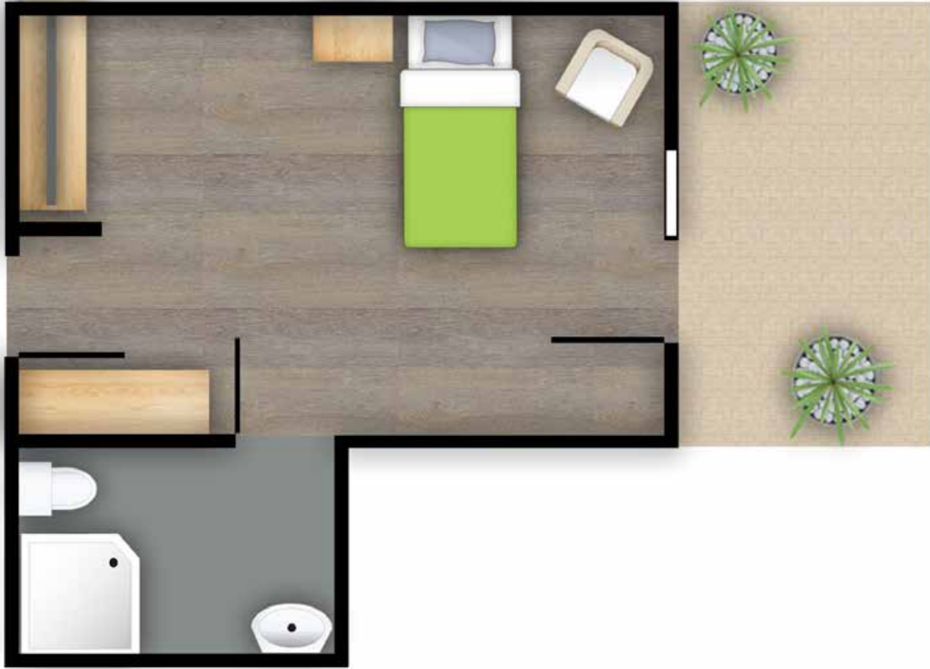
Private, suite Accessible