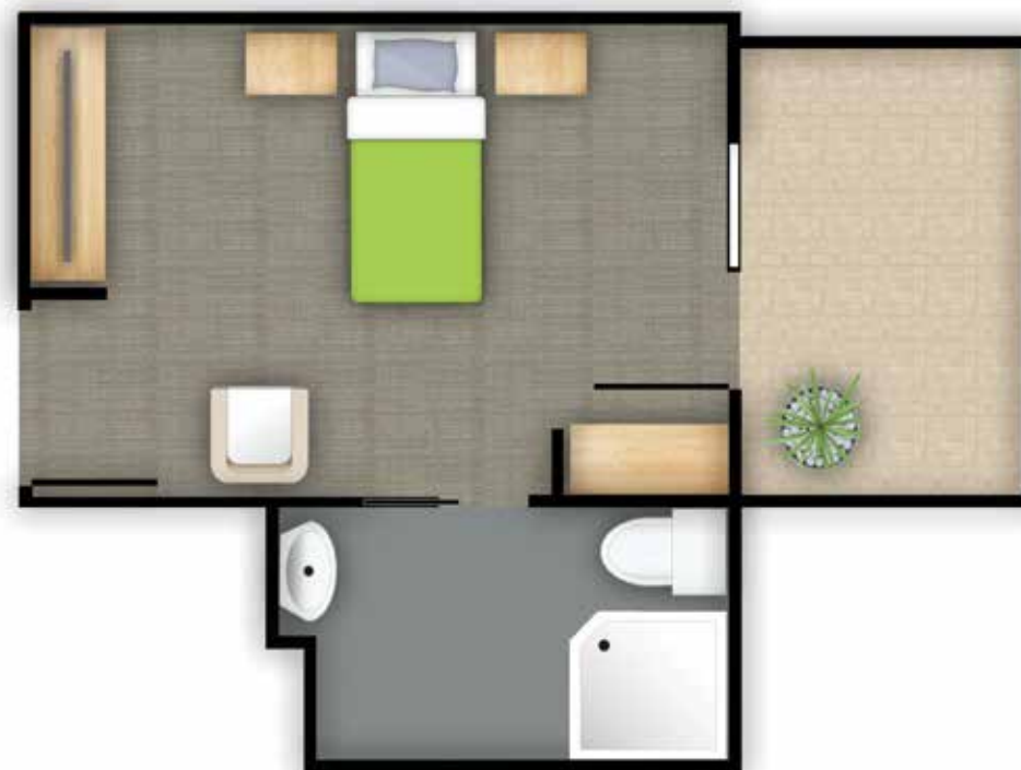
Private, suite Accessible