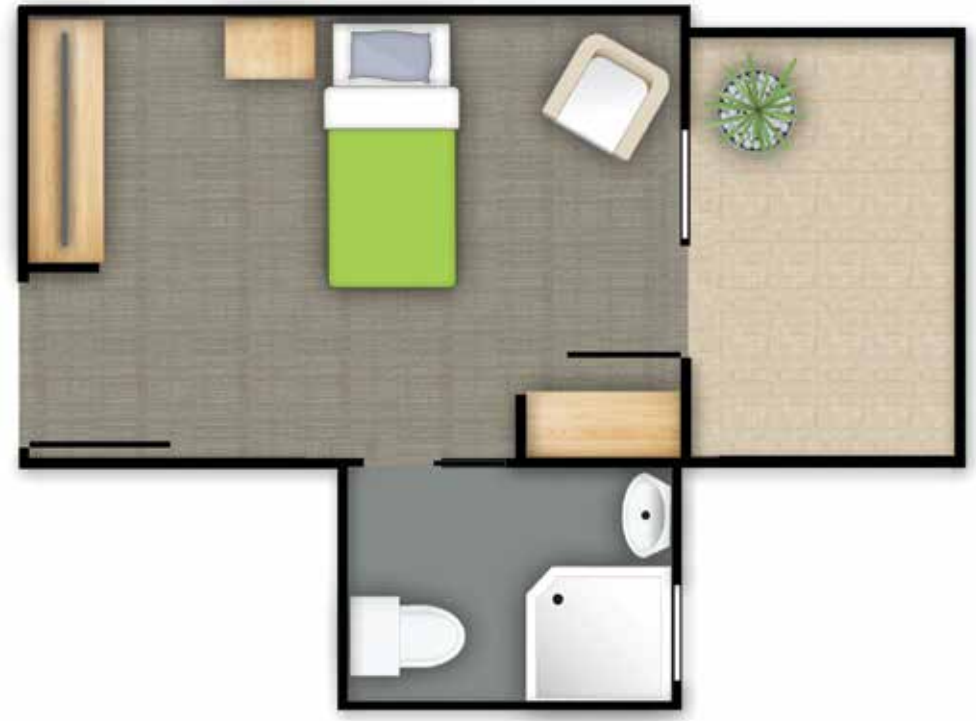
Private, suite Typical