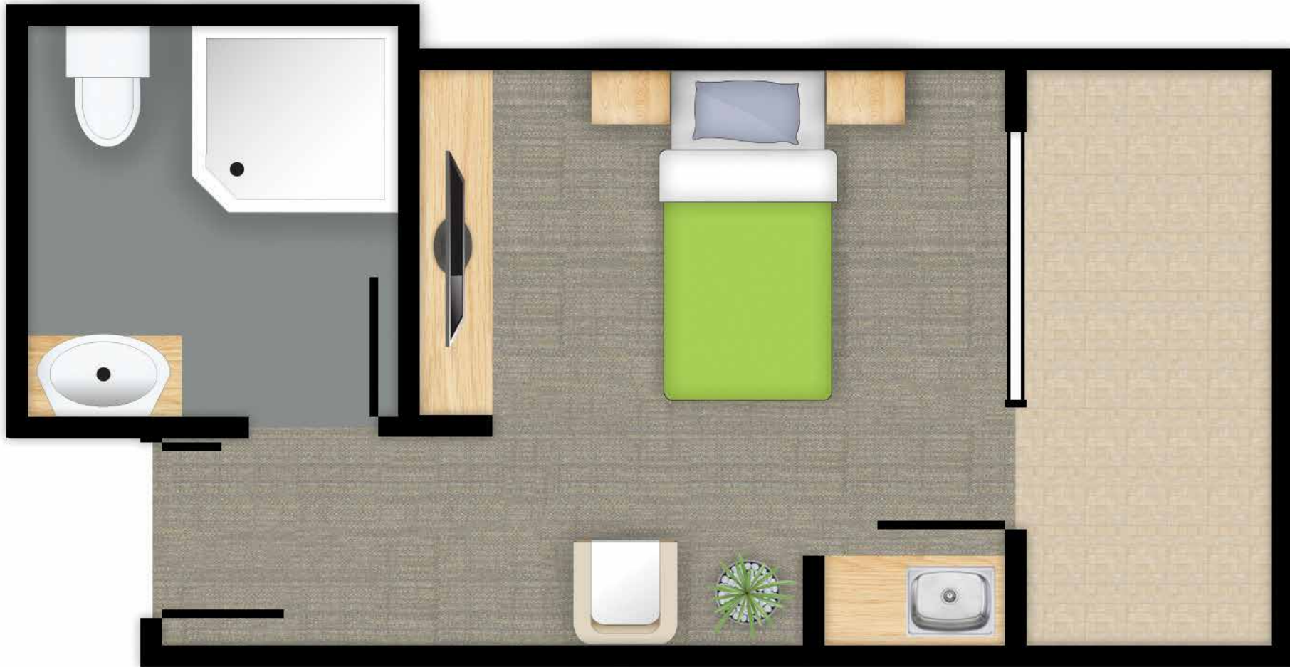
Private, suite Typical