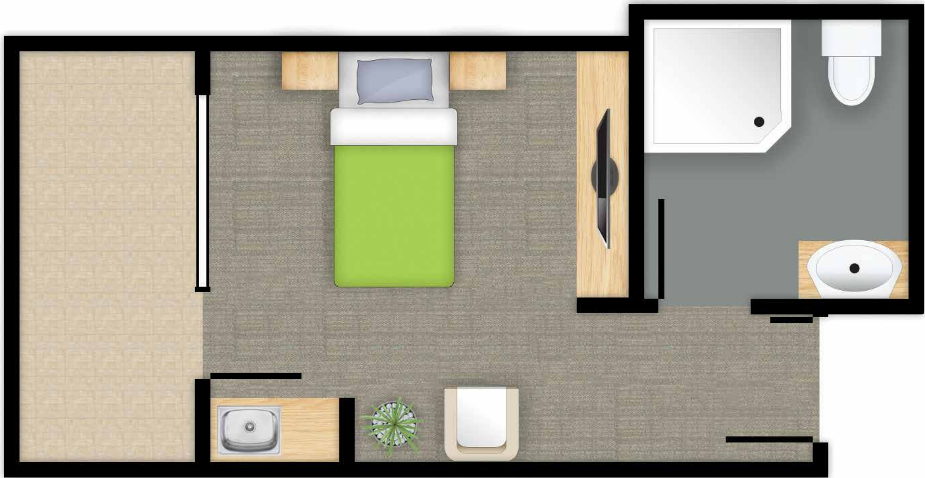
Private, suite Type A